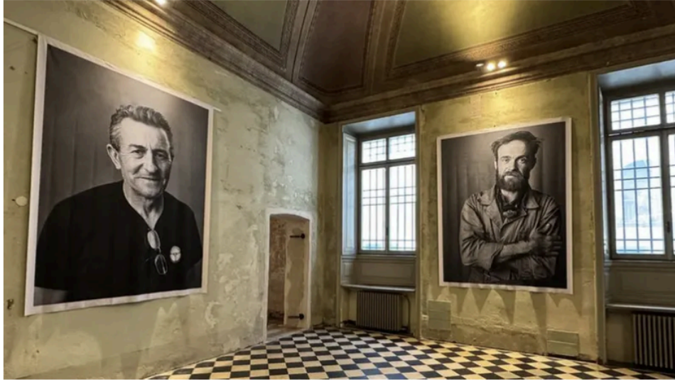
Nelle sale del Moca

«Sì, è vero. Automobile Club Brescia e 1000 Miglia srl mi hanno offerto molteplici supporti. Dall'allestire nella passata edizione della corsa uno studio fotografico temporaneo all'interno del Paddock (luogo deputato alla verifica delle vetture in gara) così da poter ritrarre non solo i meccanici italiani ma anche quelli stranieri, al seguire, obiettivo alla mano, l'attività indomita di queste maestranze lungo lo svolgimento della Mille Miglia attraverso il Bel Paese».